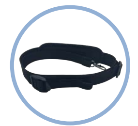
Inogen One® G4 Carry Strap* Item # CA-401